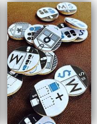
Below. A game of Ore, set up in under 3 minutes. From top to bottom: mines, resources, initiatives, assets, and contracts. Player inventories adorn the sides of the table.