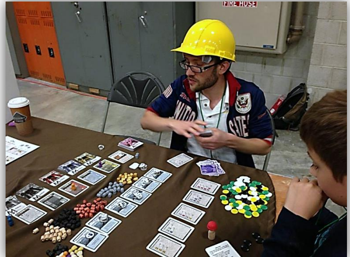
Above. Miners of all ages enjoying Ore at BFIG.

orethemininggame.com • facebook.com/orethemininggame 802-881-3493